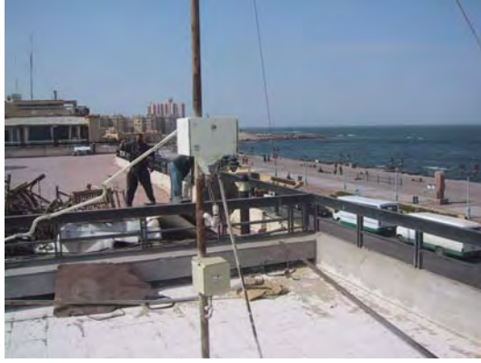
Fig.6. University Automatic Weather Station Note: Building renovations in progress.