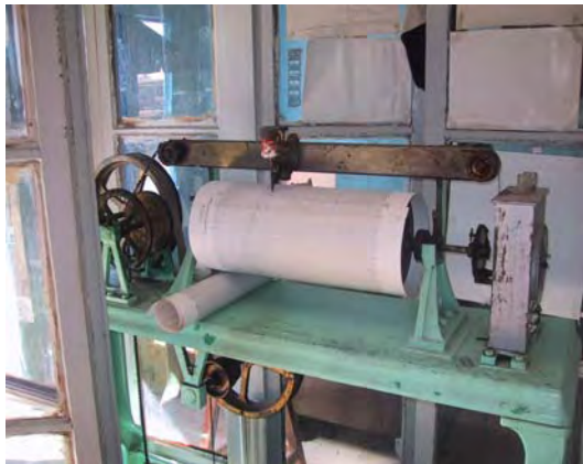
Fig.2. Port Tide Gauge installed in 1944. Manufactured by Hughes, London.

This is the same tide gauge inspected by Alan Browell in 1987 (UNESCO IOC Technical Survey) This is a large format (0.5m) clockwork drum chart recorder with a float / stilling well. The float is linked to the chart recorder by a metal tape with holes and toothed pulley. This gauge was installed in around 1944.