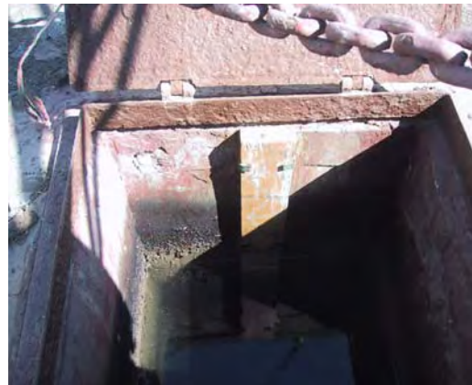
Fig.3. Adjacent tide staff and stilling well used to calibrate the tide gauge.

The Port Marine Survey Department changes the data sheets daily and tabulates the data in hand written Arabic numerals. Calibration is made with a nearby tide staff in a protected stilling well chamber outside the tide gauge cabin (Fig.3). The tide gauge stilling well is linked to the open seawater by a submerged pipe, which dampens any surface / wind wave oscillations except the harbour seiche. No information was available on the relationship between the tide staff and nearby benchmark. This will be resolved with the Port Marine Survey Department Staff and Egyptian Navy Hydrographic Department in the near future with a follow up report.