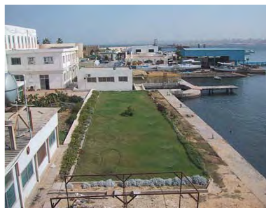
Fig.5. View of NIOF from the adjacent University Building with the sea front location proposed for the OdinAfrica Tide Gauge. Separate NIOF meeting room at end of grass lawn-proposed site for data logger/solar panel.