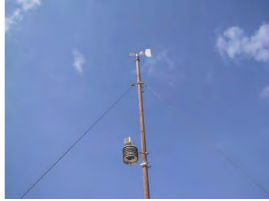
Fig.7. Weather Station sensors