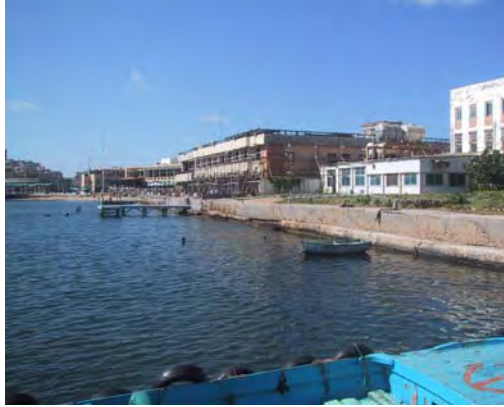
Fig.3. University of Alexandria, Oceanography Department (undergoing major renovations) adjacent to NIOF.