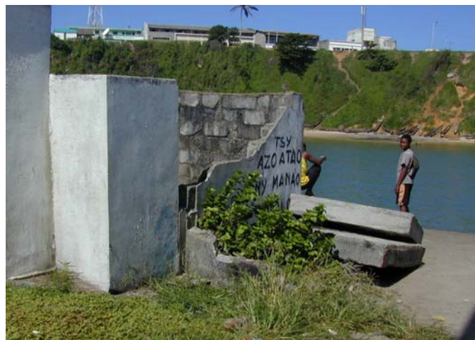
Figure 5 : Ruins (probably) of the old tide pier installed by CNRE and FTM (at the end of the main pier).

The National Institute of Geodesy and Cartography of Madagascar (FTM) and the Centre National des Recherches sur l'Environnement (CNRE) have installed a floating sensor tide gauge at the end of the main pier but the instrument stopped functioning correctly in 1998. In 2001, a big fissure (crack) appeared in the tide house wall and the equipment has been recovered. The tide gauge hut collapsed in 2002. It's difficult to find the exact location of the corresponding ruins without an accurate plan (see figure 5 below).