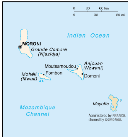
Figure 6 : Archipelago of COMORES

Coastal town of Moroni is located in the west part of the island ( 43^{\circ}14,5' E - 11^{\circ}42'S ).