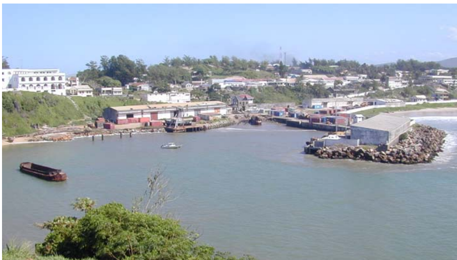
Figure 4 : View of the Fort-Dauphin port.

A visit of the port installations was organized with the port master. There isn't any guard to ensure the security of the port. Any gate also. Many damaged containers, neglected within harbour, are used by poor people as habitation.