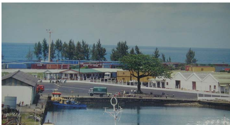
Figure 3 : The location of the old tide gauge is (approximately) just behind the van.

The old tide gauge installations (tide house, tide well and associated BM) have been destroyed and replaced by a fresh new car park in 2005 (see figure 3 below).