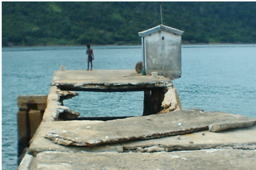
Figure 1 : Pier of CNRO (damaged by GAFILO storm) with the tide gauge hut

The pier was seriously damaged by the storm GAFILO in 2004. It must be rebuilt before any tide gauge installation. (See figure 1 below)