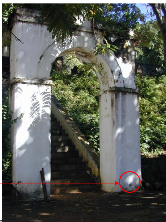
Figure 2 : French Hydrographic Office BM

The distance between the BM and the tide house is about 80 metres, and not too long for classic levelling.